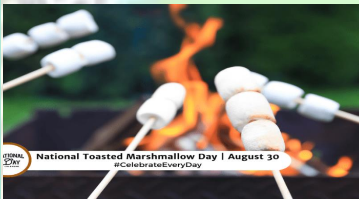
National Toasted Marshmallow Day | August 30 #CelebrateEveryDay