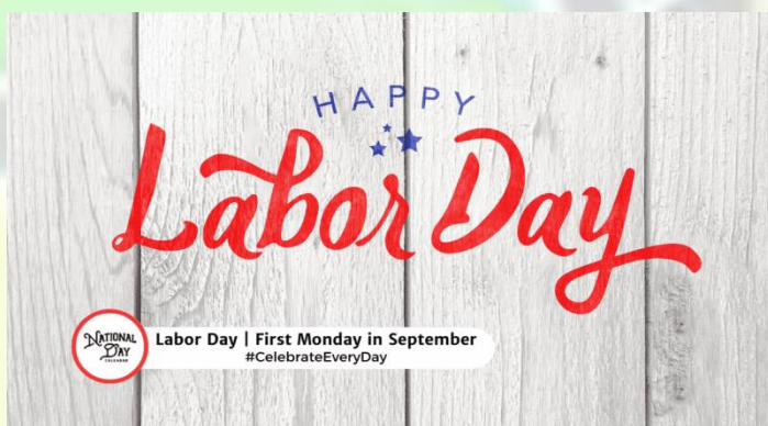
Labor Day | First Monday in September #CelebrateEveryDay